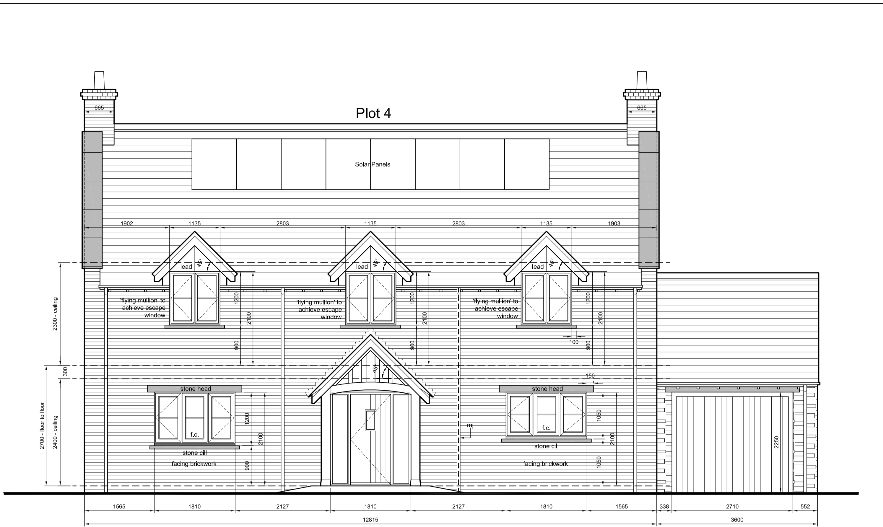
Proposed Front Elevation (South East) Scale 1:50 @ A1 / 1:100 @ A3