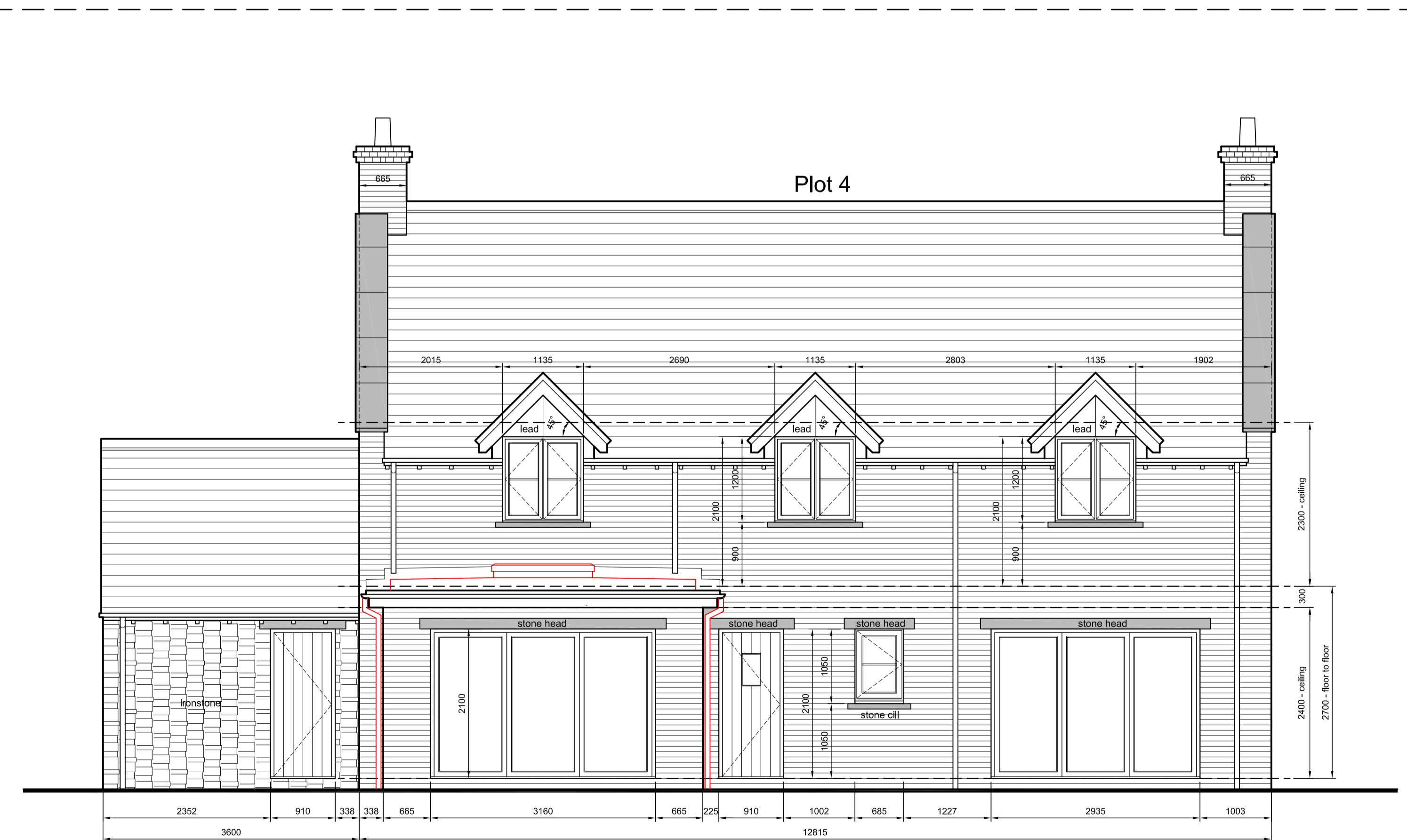
Proposed Rear Elevation (North West) Scale 1:50 @ A1 / 1:100 @ A3