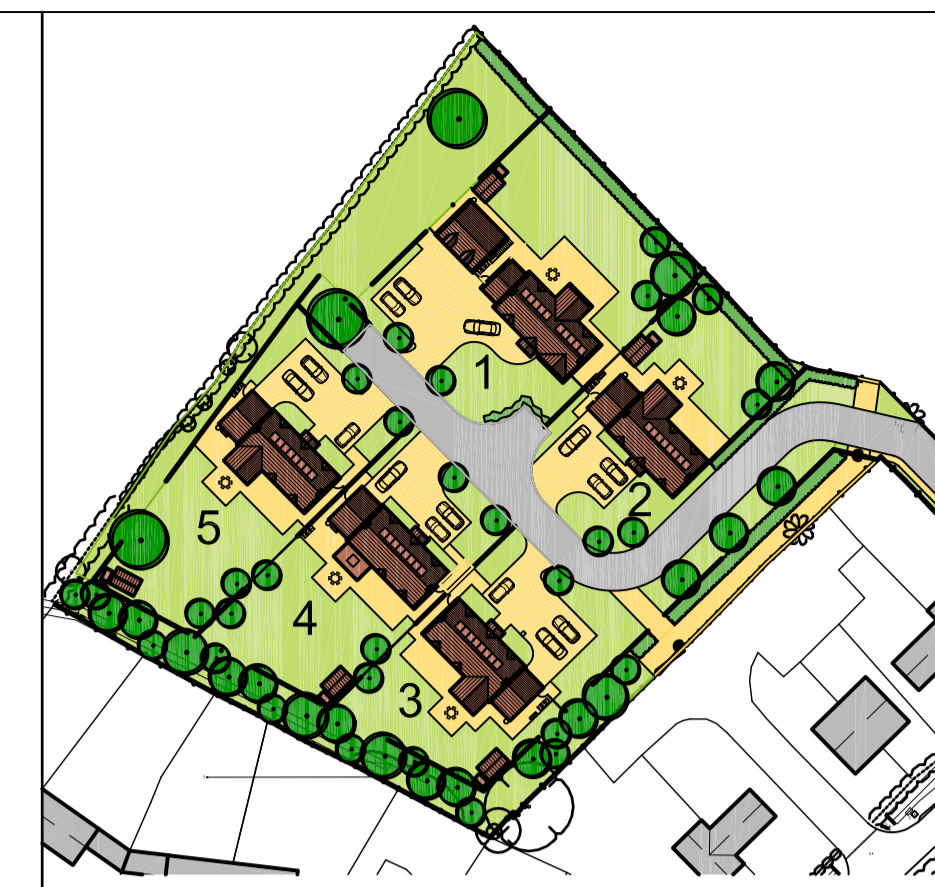
Proposed Site Plan Scale 1:1000 @ A1 / 1:2000 @ A3