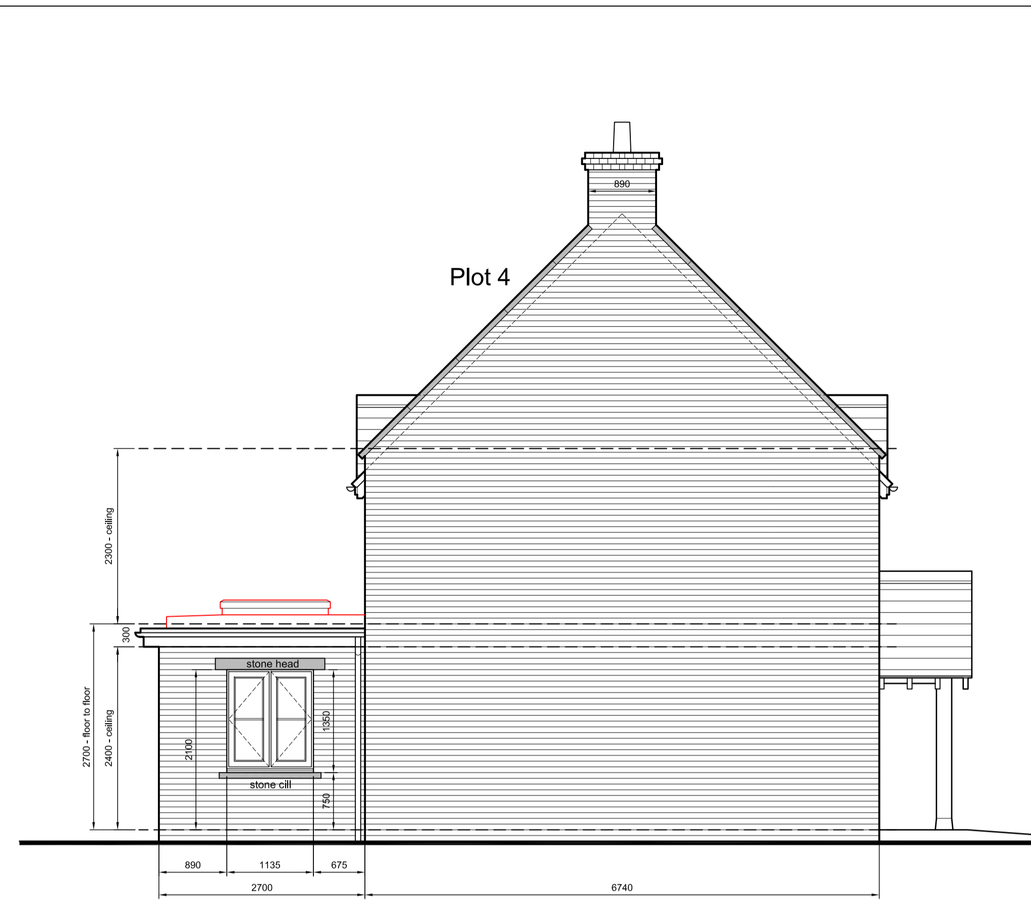
Proposed Side Elevation (South West) Scale 1:50 @ A1 / 1:100 @ A3